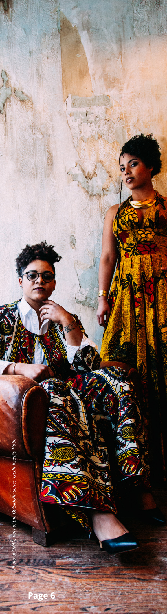
Photo of OKAY, part of the Outside/In series