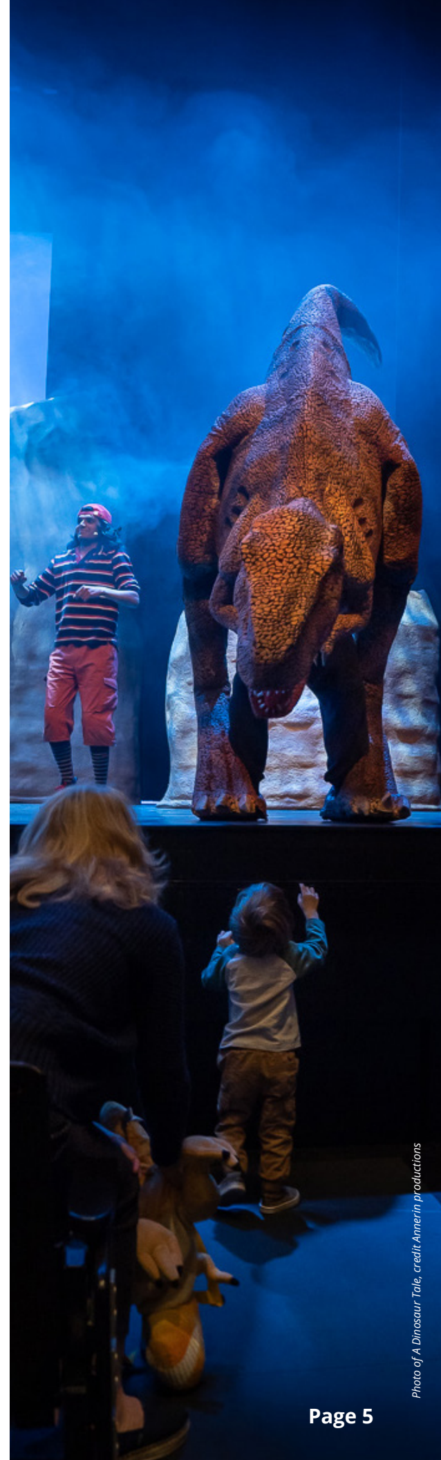
Photo of A Dinosaur Tale

We received a permanent Liquor license and launched a Food and Beverage Service Program which aims to elevate the audience experience in the facility while showcasing and working with local suppliers.